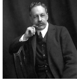
Halford Mackinder, in full Sir Halford John Mackinder, (born February 15, 1861, Gainsborough , Lincolnshire, England—died March 6, 1947, Parkstone, Dorset), British political geographer noted for his work as an educator and for his geopolitical conception of the globe as divided into two camps, the ascendant Eurasian “heartland” and the subordinate “maritime lands,” including the other continents. He was knighted in 1920.