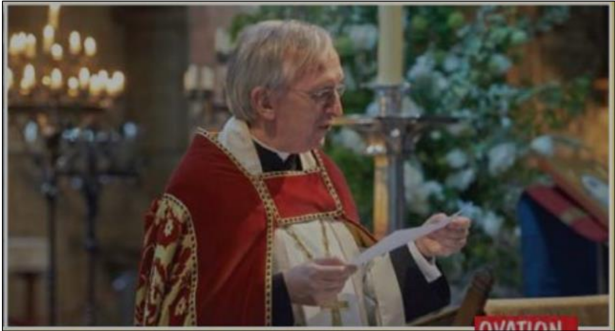
Figure 2: The Reverend Martin Dudley BD MTh PhD FSA FRHistS AKC.

https://web.archive.org/web/20050404161930/http://www.greatstbarts.com/default.htm